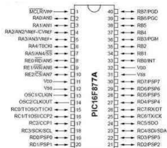
Fig.3 PIC16F877A pin diagram

PIC16F877A finds its applications in a huge number of devices. It is used in remote sensors, security and safety devices, home automation and in many industrial instruments. An EEPROM is also featured in it which makes it possible to store some of the information permanently like transmitter codes and receiver frequencies and some other related data. The cost of this controller is low and its handling is also easy. Its flexible and can be used in areas where microcontrollers have never been used before as in coprocessor applications and timer functions etc.