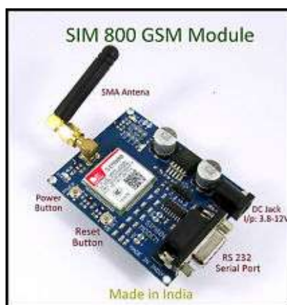
Fig.5 SIM800 GSM Module

GSM refers to Global system for mobile communication which is the key factor in this paper to inform about the where-about of the fishermen in the vast seas. A common European mobile telephone standard that would formulate specifications for a pan-European mobile cellular radio system operating at 900 MHz. A GSM modem is a wireless modem that works with a GSM wireless network. GSM also make sure that all the communication made between networks are secured and protected from intruders and frauds.