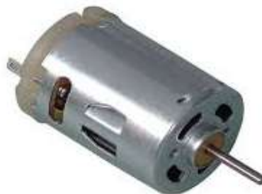
Fig.8 DC Motor

DC motor is electric motor that runs on direct current directly. It converts direct current electrical power into mechanical power.DC motor used to change the direction of current flow and motor voltage is proportional to speed.