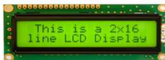
Fig.9 LCD display 2x16

LCD stands for Liquid Crystal Display; this is an output device with a limited viewing angle. The choice of LCD as an output device was Because of its cost of use and is better with alphabets when compared with a 7-segment LED display. We have so many kinds of LCD today and our application requires a LCD with 2 lines and 16 characters per line, this gets data from the microcontroller and displays the same.