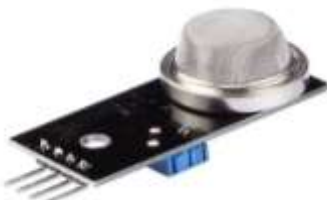
Fig.4 : Gas Sensor

Sensitive material of MQ-13 gas sensor is \text{SnO}_2 which with lower conductivity in clean air. When the target flammable gas exist, the sensor's conductivity gets higher along with the gas concentration rising. Users can convert the change of conductivity to correspond output signal of gas concentration through a simple circuit. This sensor can detect kinds of flammable gases, especially has high sensitivity to LPG (propane). It is a kind of low-cost sensor for many applications. It is widely used in domestic gas leakage alarm, industrial flammable gas alarm and portable gas detector.